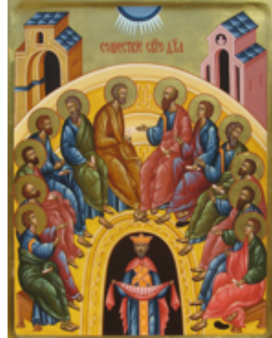
DESCENT OF THE HOLY SPIRIT