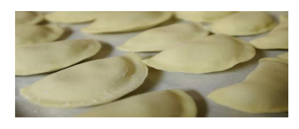
SAVE THE DATE: - Pyrohy making is scheduled for Monday, December 14th . We need your help and your presence!

Please mark your calendar, so you don't forget!